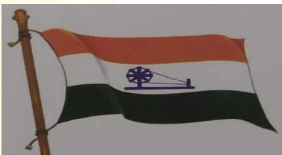
The flag adopted in 1931.

to represent India's independence from foreign markets for the cloth. In 1921 without any resolution, it became the national flag of India. In 1923 as part of the Civil Disobedience Movement in Jabalpur a procession with the national flag was planned. Due to various events in this procession, it started being known as 'Jhanda Andolan'. The most significant achievement of 'Jhanda Andolan' was that it gave us a flag for which every Indian, irrespective of caste & creed, was willing to lay down his life.