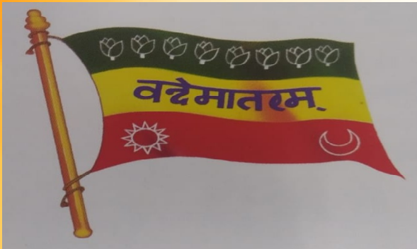
The Calcutta flag, 1906.

The idea of the national flag for India as a symbol of national pride germinated a couple of decades before our Independence. The very idea of India as consciousness was yet to be born, which would soon be, so was a flag to represent that unity, that consciousness. Dynasties, rulers and warriors, who were