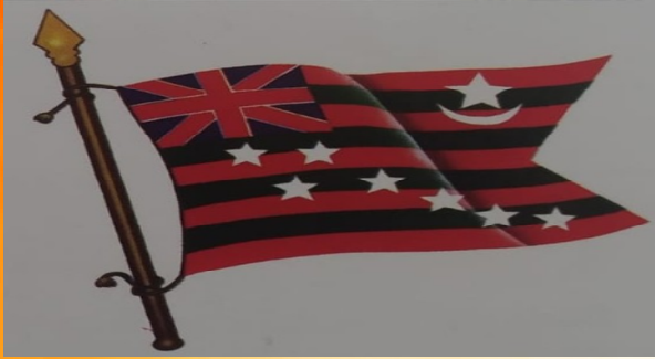
The flag used during the Home Rule movement in 1917

In 1917, the Home Rule League Movement was ably led by Shri Bal Gangadhar Tilak and Mrs. Anne Besant designed a flag to represent the spirit of the movement.